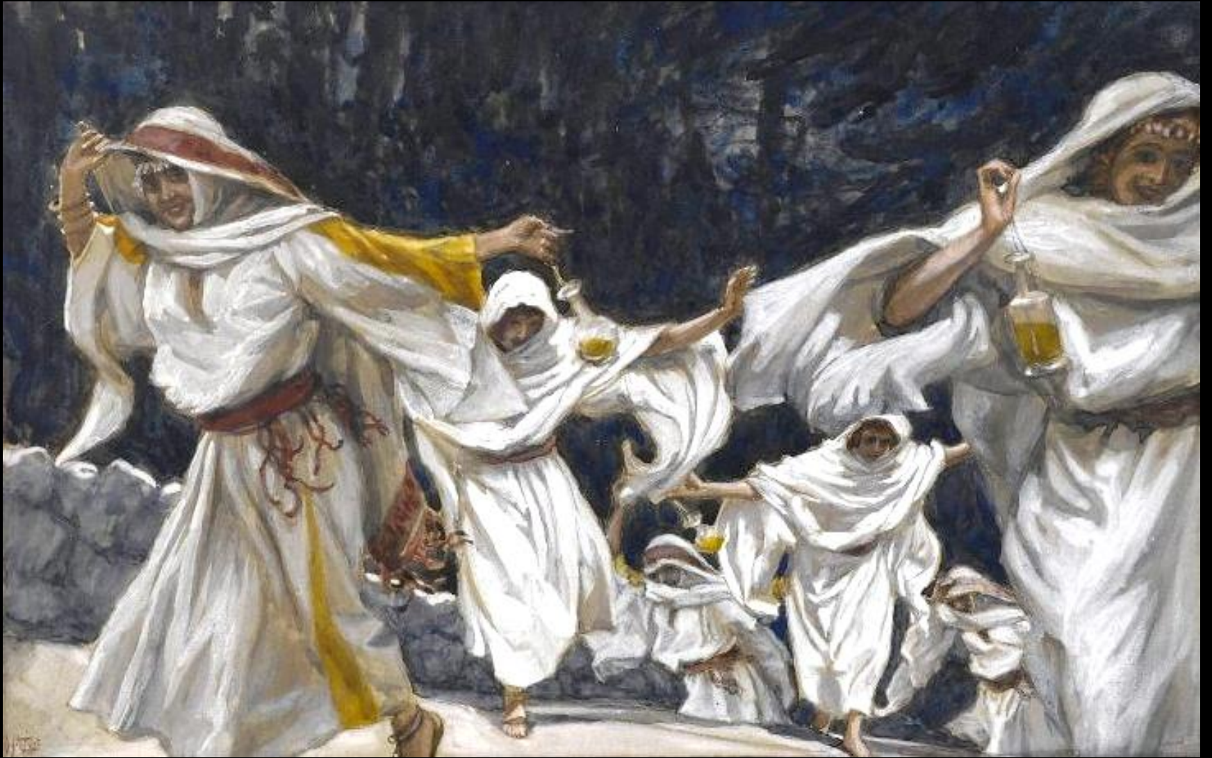
The Bridesmaids -- James Tissot, Brooklyn Museum, New York, NY