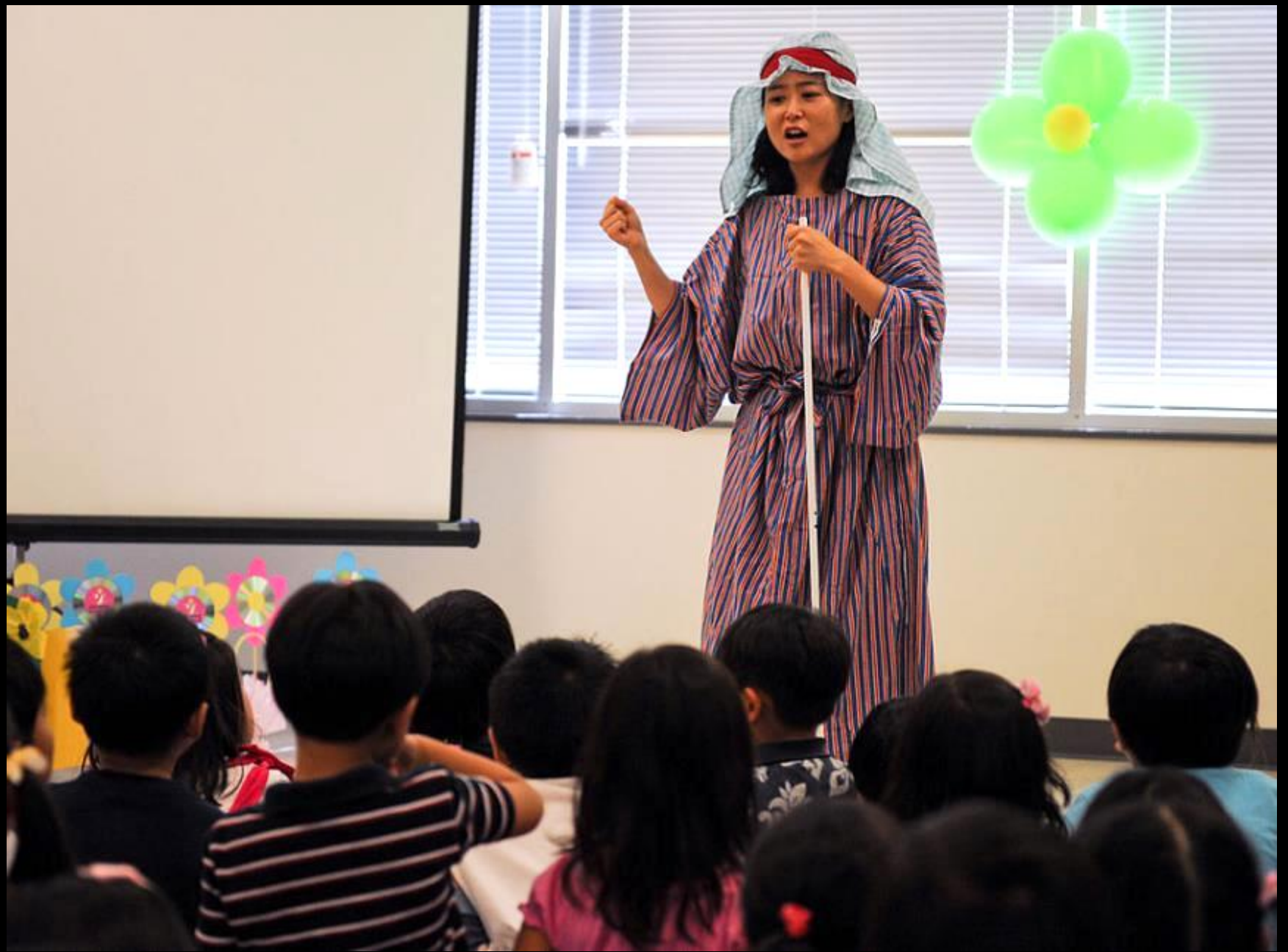
Sunday School -- Korean Central Presbyterian Church, Centreville, VA