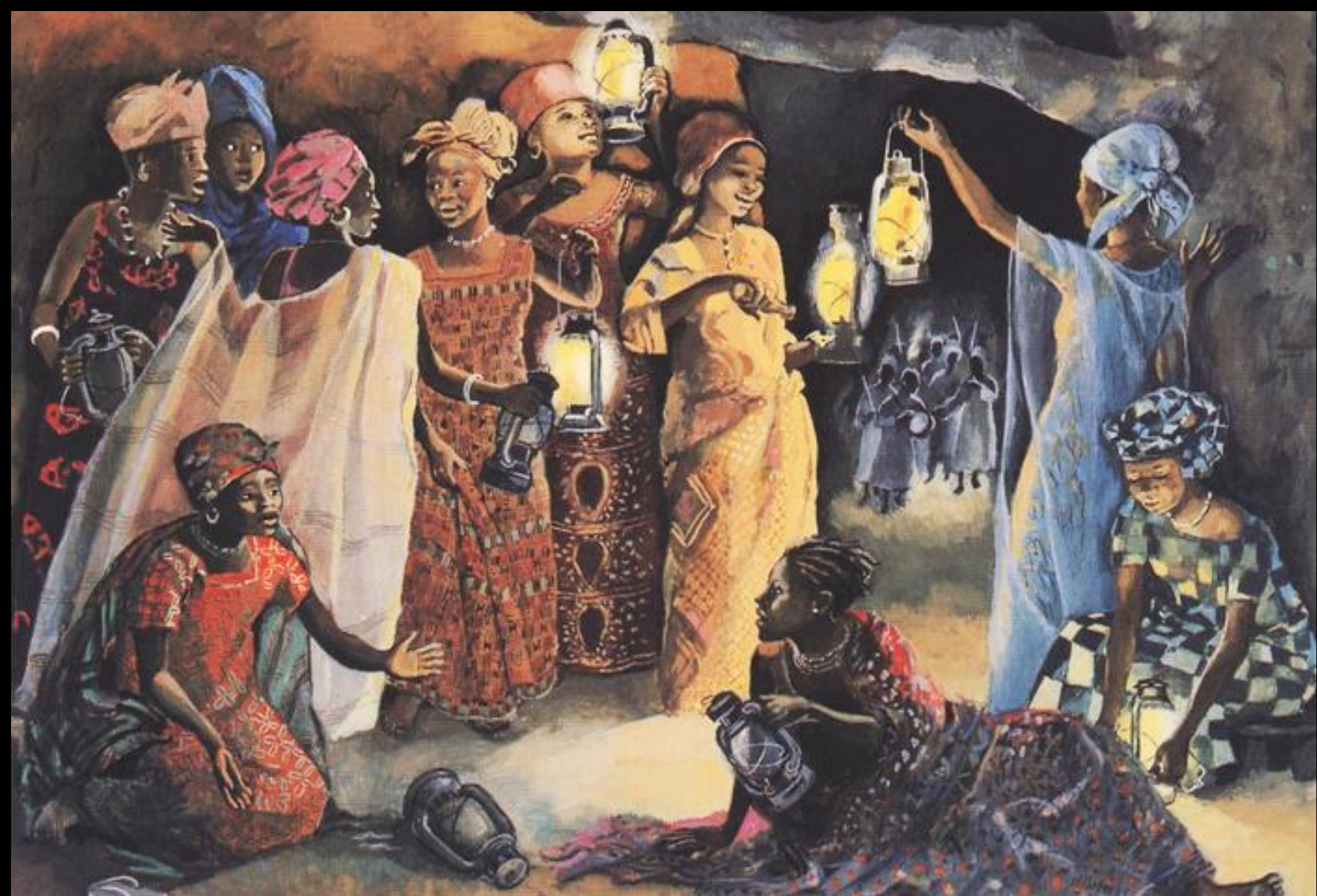
The Ten Bridesmaids -- JESUS MAFA, Cameroon