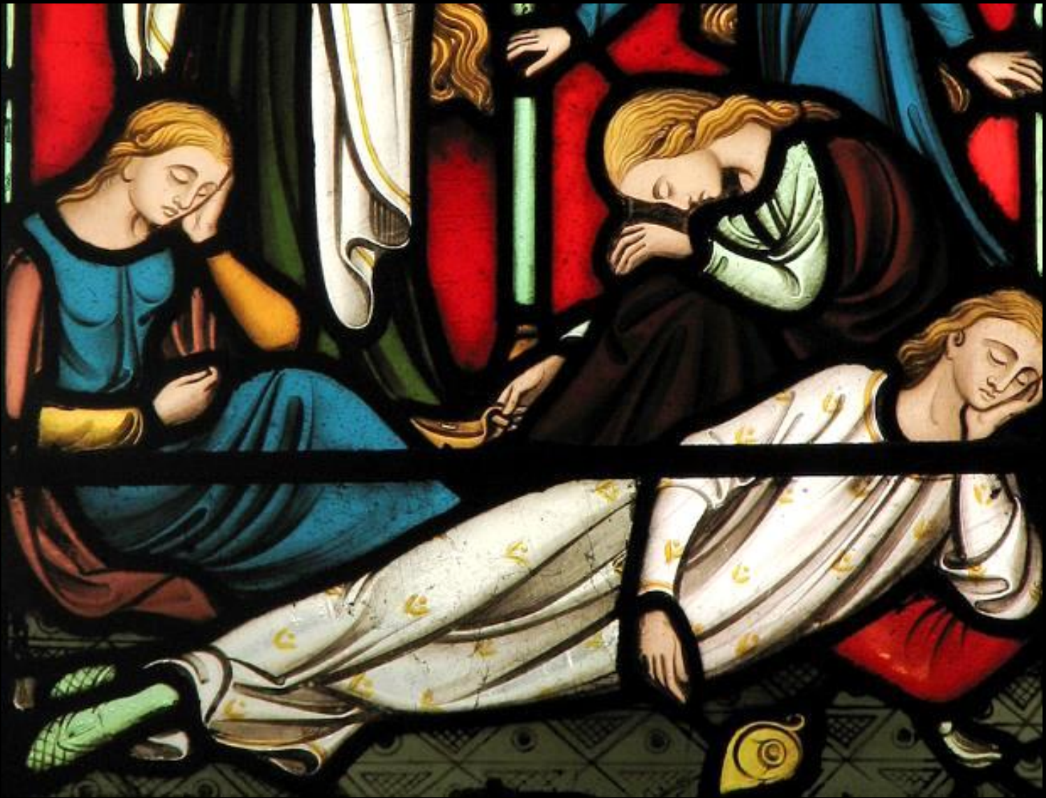
The Bridesmaids Sleeping -- Stained Glass, Church of St. Giles, Oxford, England