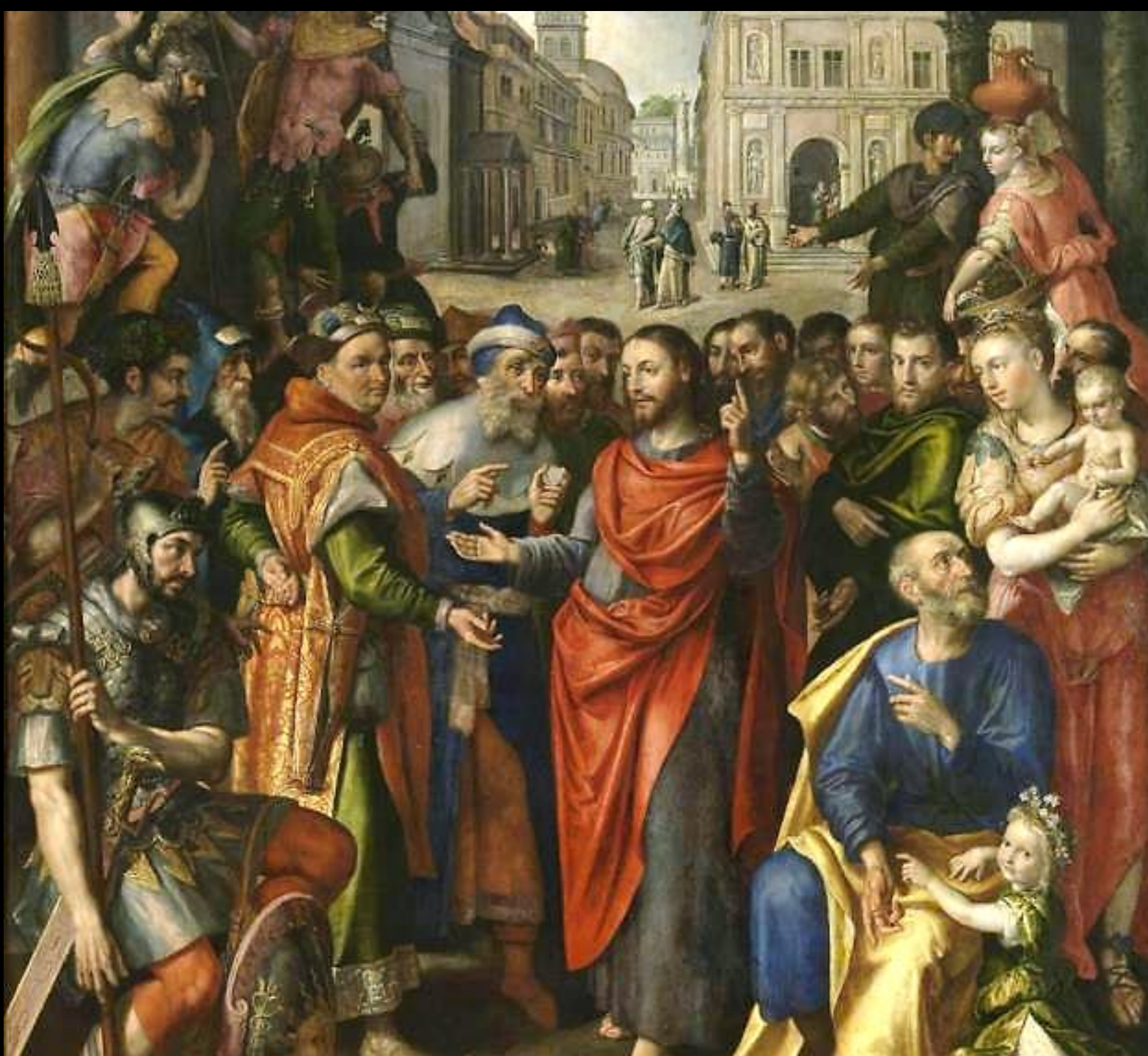
The Tribute Money

Marten de Vos Royal Museum of Fine Arts Antwerp, Belgium