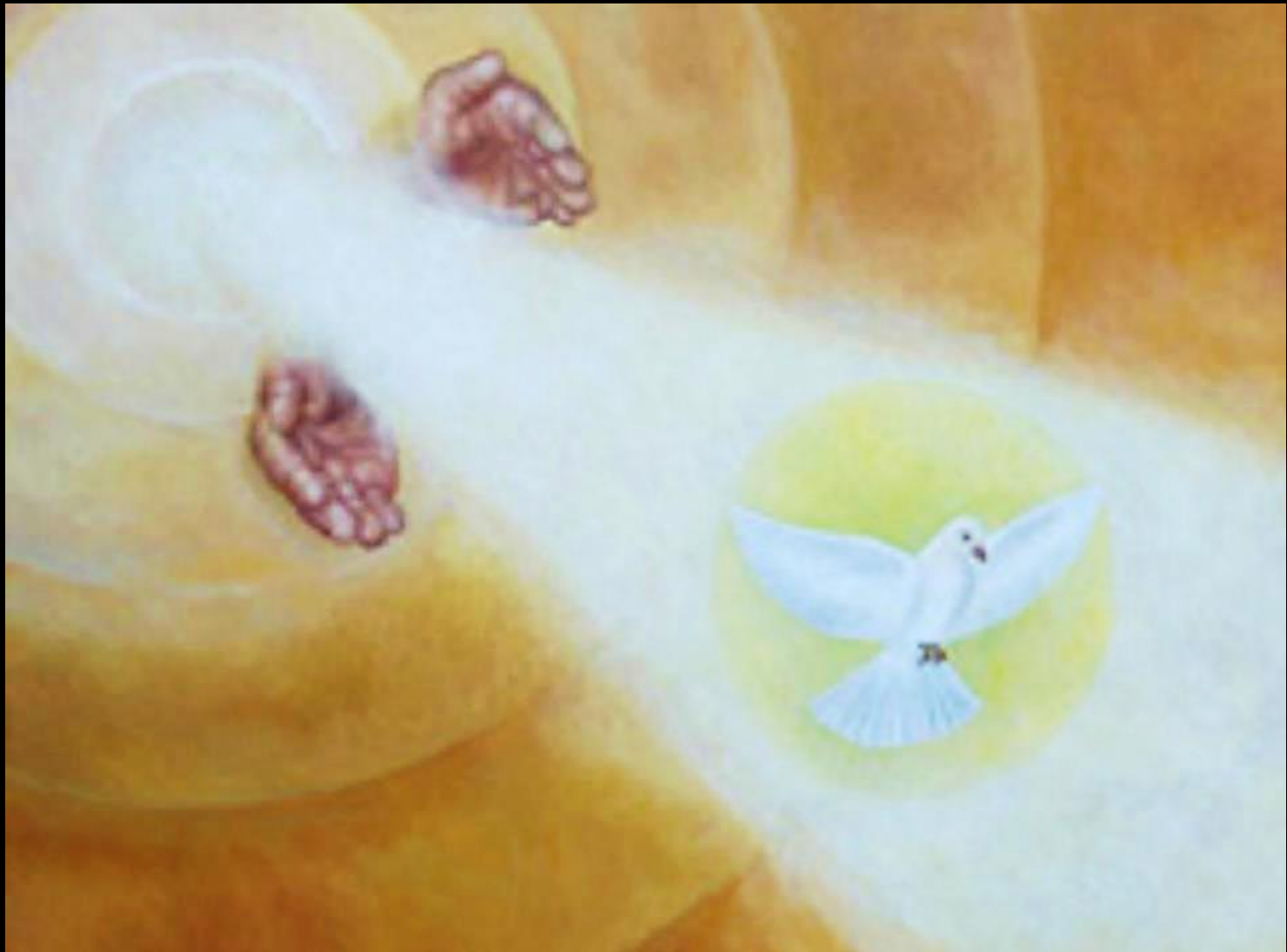
Church of the Holy Trinity, Caacupe, Paraguay