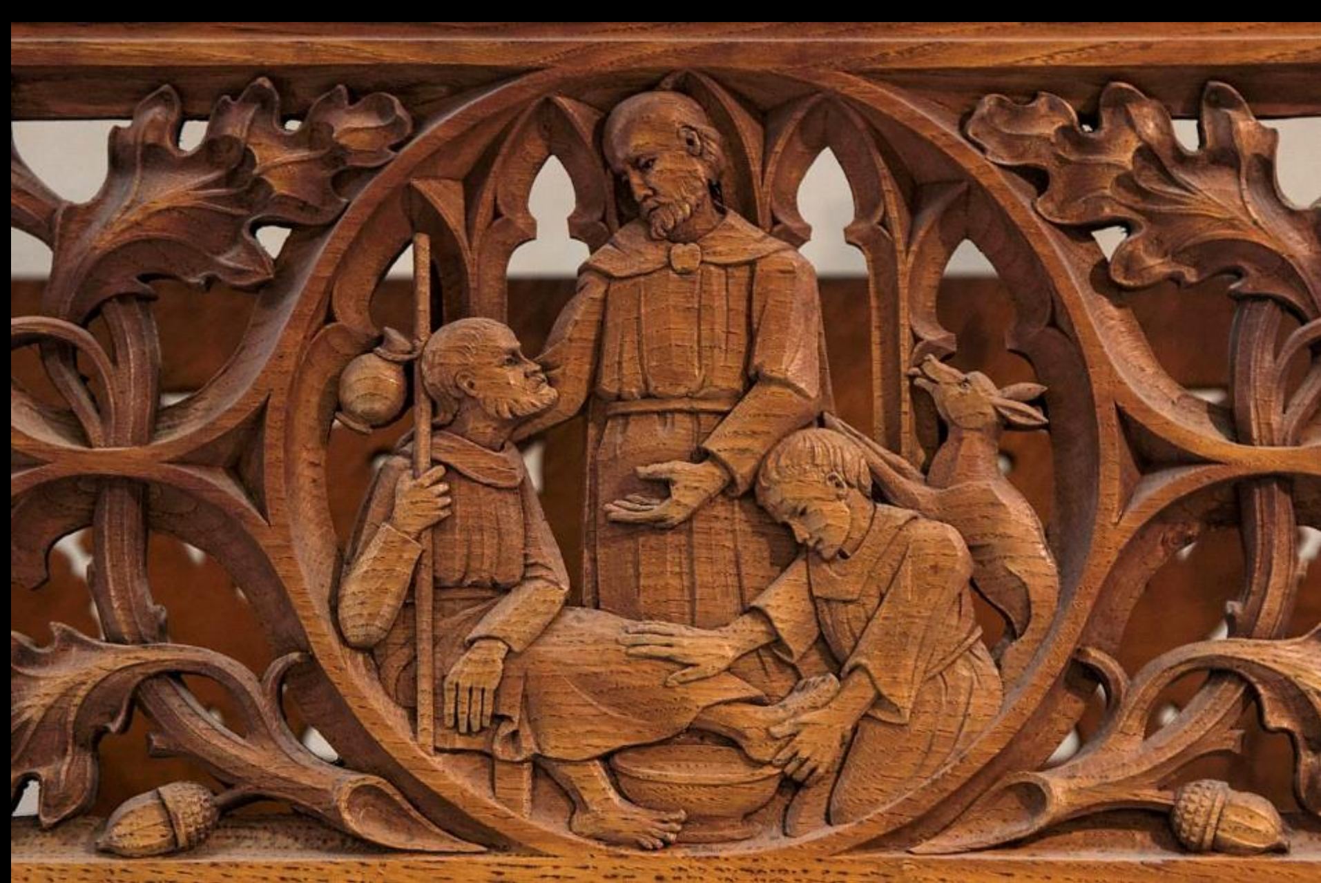
Love for One's Neighbor -- Choir screen carving, Museum of Scotland, Edinburgh, Scotland