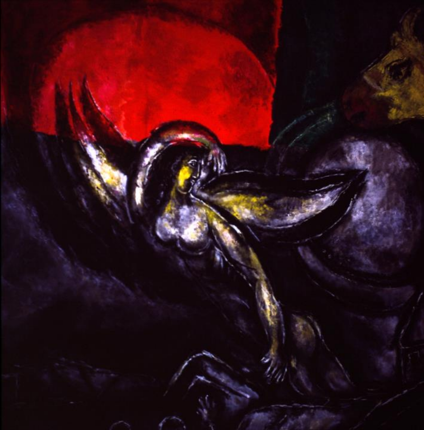
Angel of Death Passing Over

Marc Chagall, Musée du Message Biblique Chagall Nice, FR