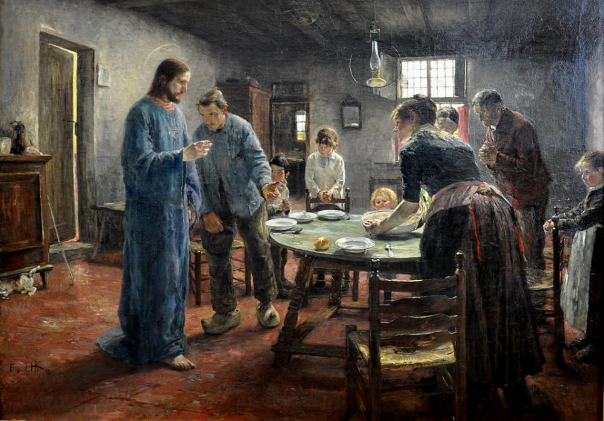
The Mealtime Prayer -- Fritz von Uhde, Alte Nationalgalerie, Berlin, Germany