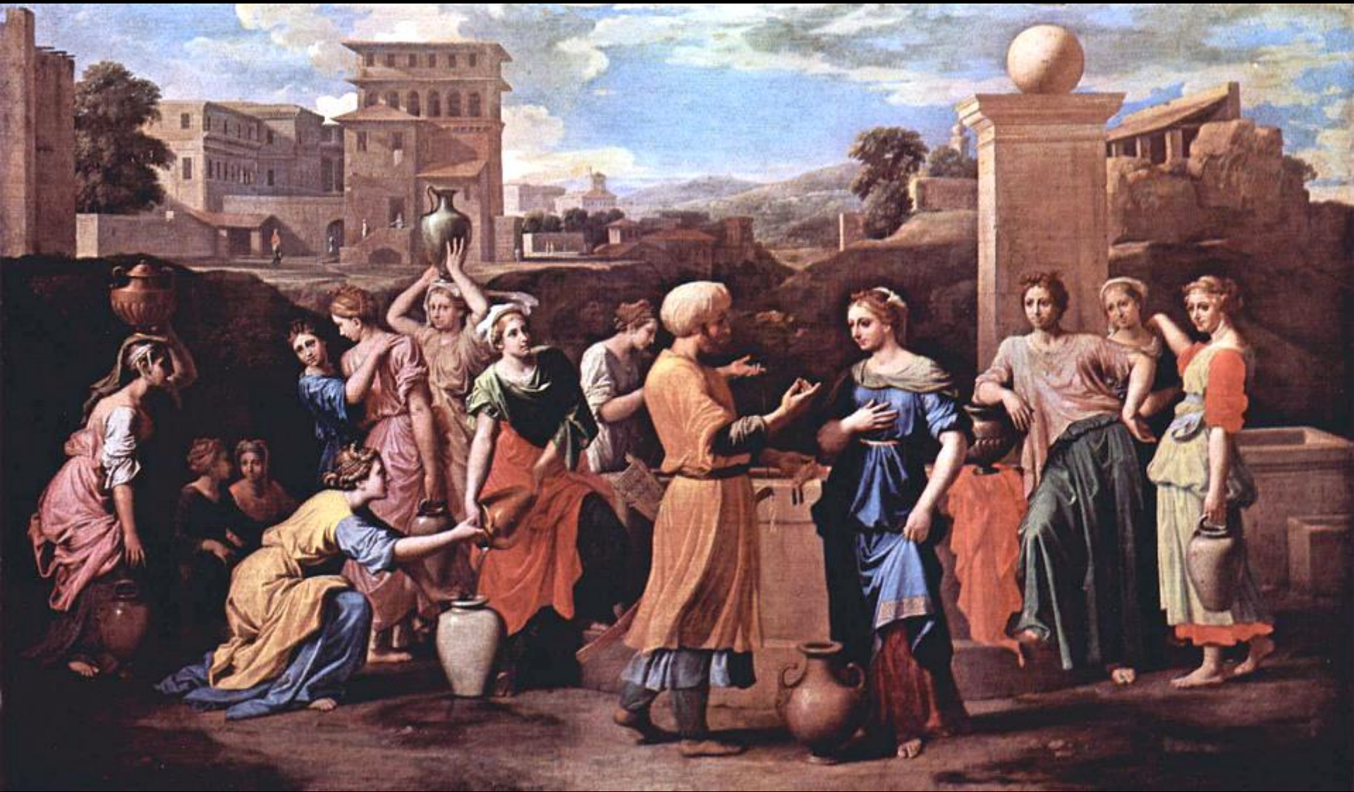
Rebecca at the Well -- Nicolas Poussin, Louvre Museum, Paris, France