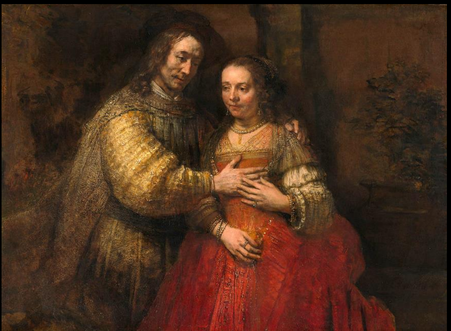
Isaac and Rebecca -- Rembrandt, Rijksmuseum, Amsterdam, Netherlands