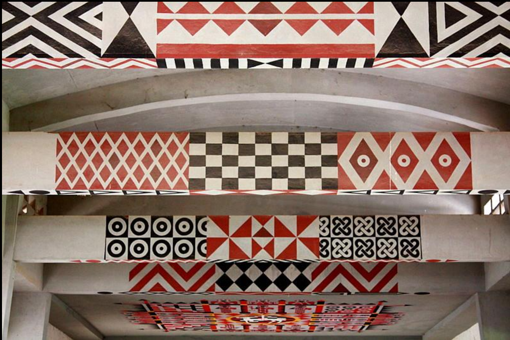
Ceiling of Keur Moussa Abbey, Senegal