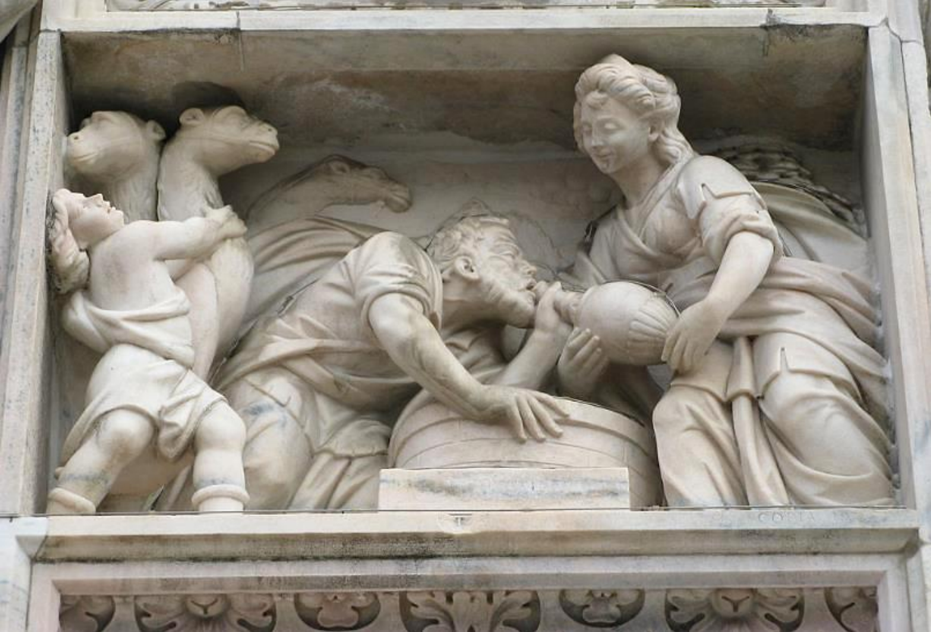
Isaac's Messenger Drinks from Rebecca's Jug -- Duomo, Milan, Italy