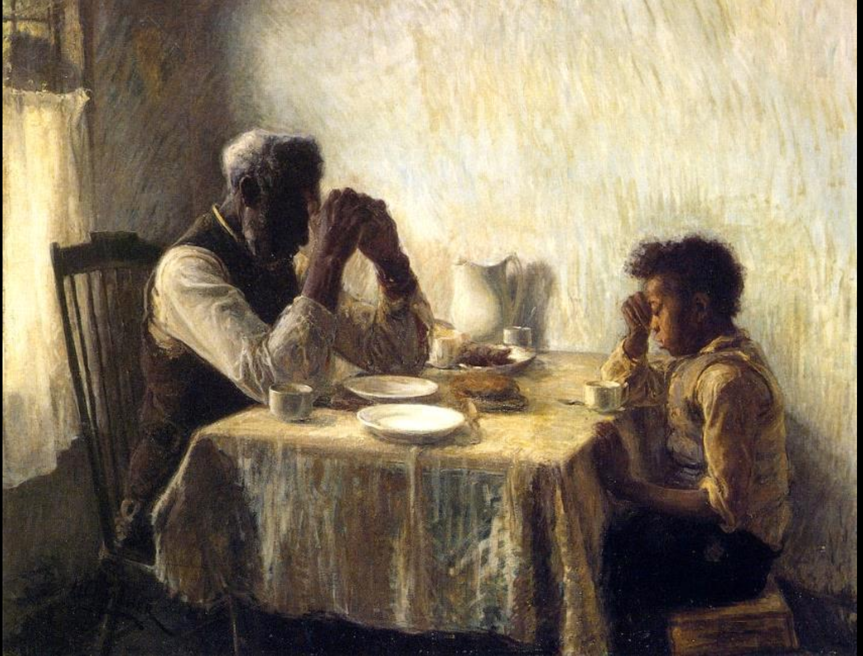
The Thankful Poor -- Henry Ossawa Tanner